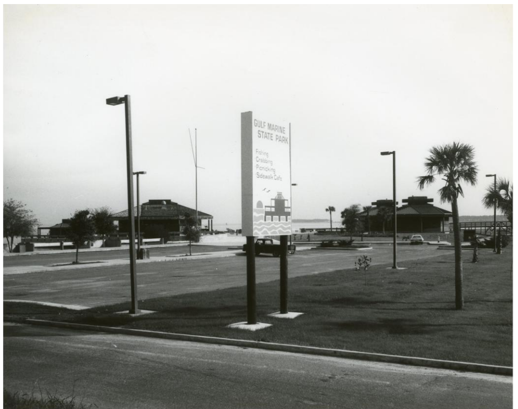
Gulf Marine State Park at Point Cadet. Opened in July, 1977, and was the location for many fishing rodeos; destroyed in Hurricane Katrina in 2005.

To see Council action on individual agenda items click here