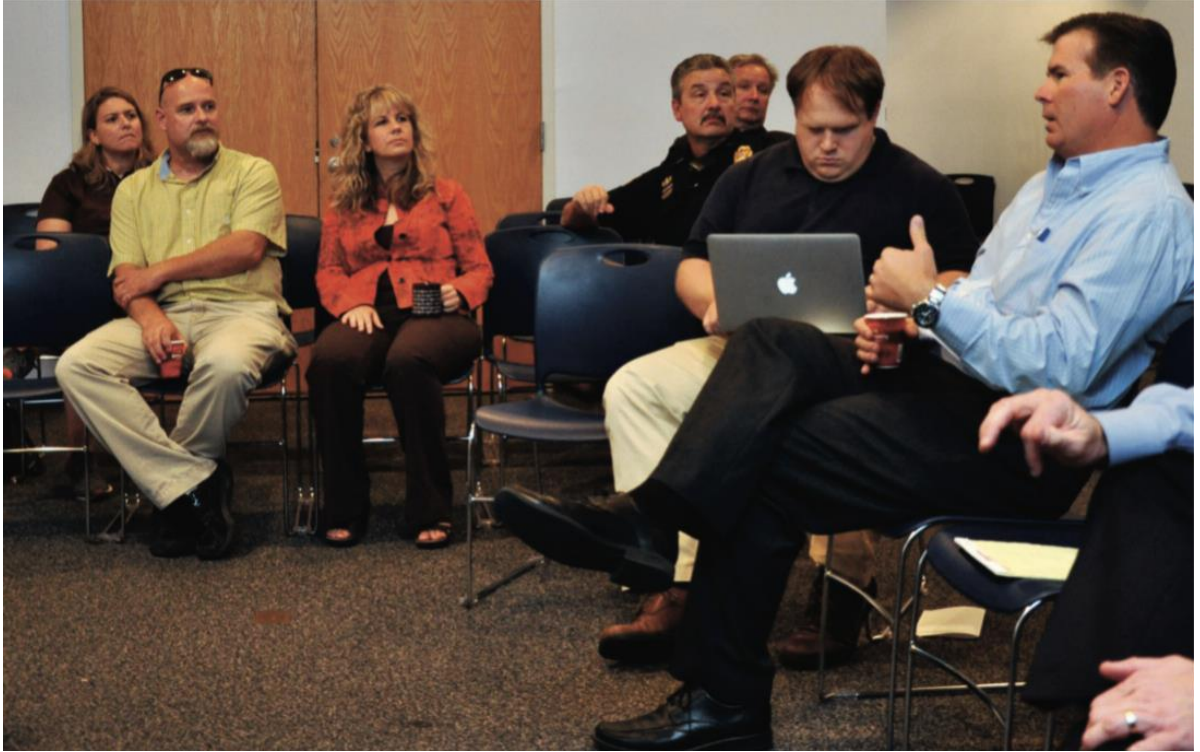
PPI Committee Meeting, October 22, 2015.