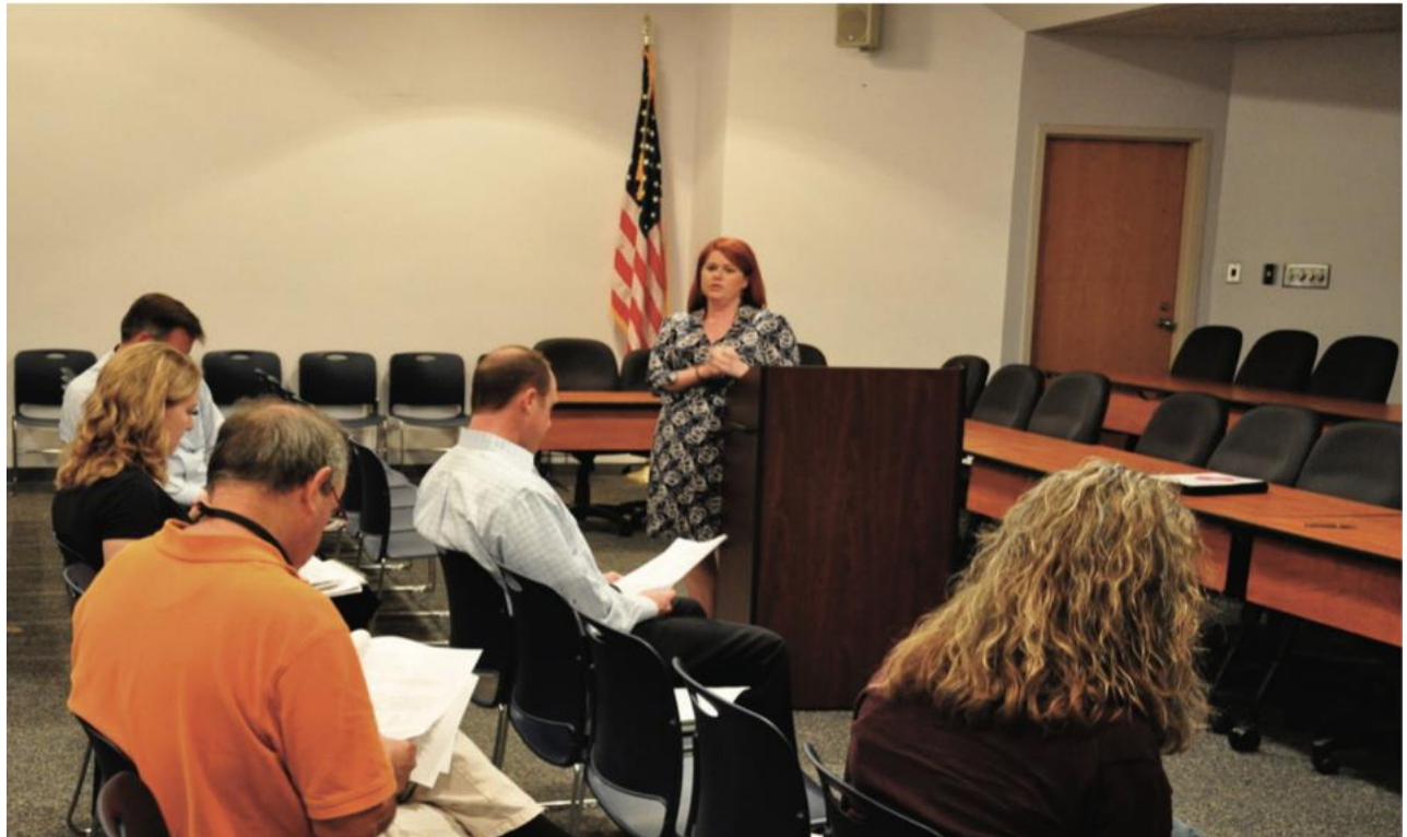
PPI Committee Meeting, March 14, 2016.