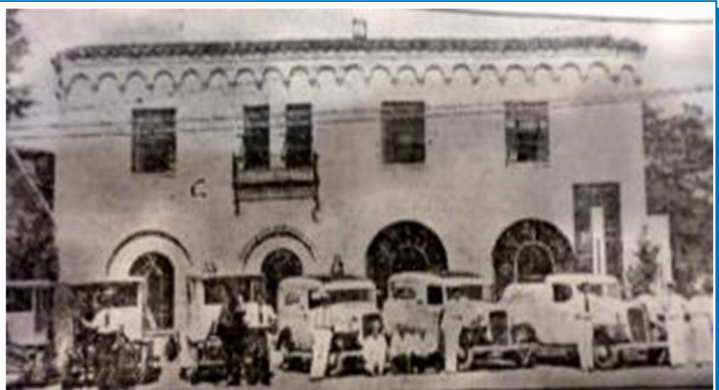
Ness Creamery , Howard Avenue & Caillavet Street, Biloxi, 1934... then Borden's Milk. then Josette's and now condominiums.

To see Council action on individual agenda items click here