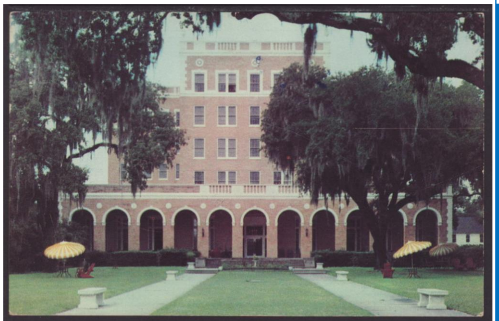
The Tivoli Hotel , Highway 90, date unknown; about where the Biloxi Yacht Club is now located.

Council action on this past week's meeting/agenda... Video (1:37:16) To see Council action on individual agenda items click here .