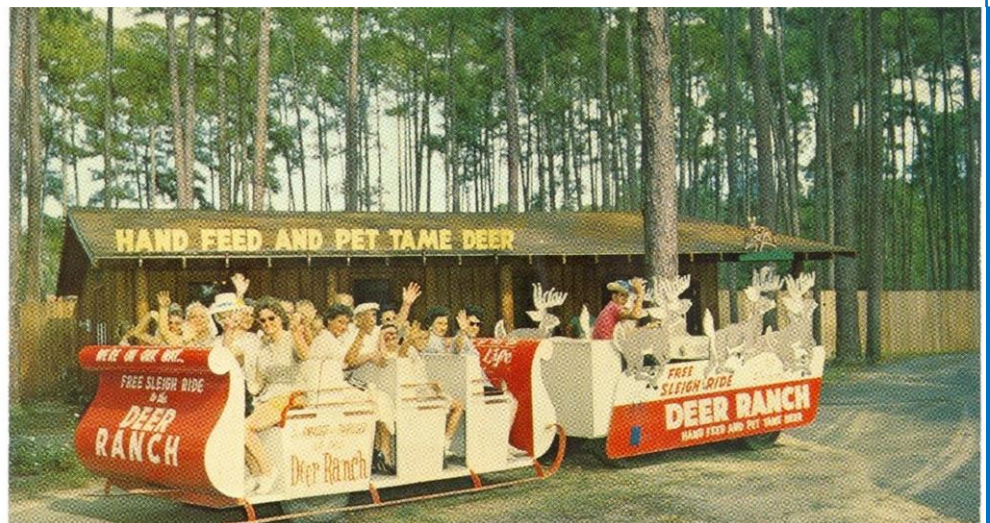
Another pic of the Deer Ranch, Debuys Road, Biloxi, date unknown

Originally scheduled for Tuesday, January 18, the State of the City, a ticketed event, has been rescheduled for Tuesday, April 19.