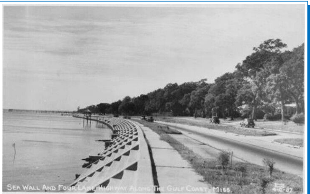
The seawall was constructed in 1927; the sand beach was added in 1951.