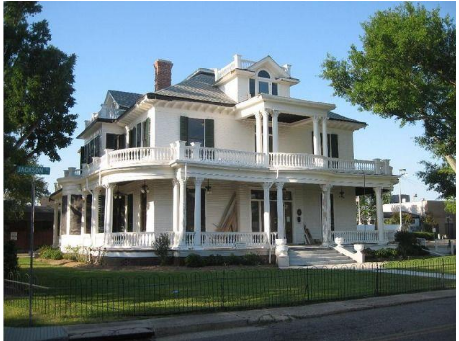
The Redding House , 770 Jackson Street, Biloxi