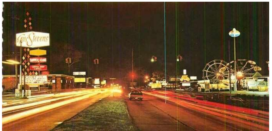
Hwy 90, looking east... Gus Stevens restaurant was on the east corner of Veterans Avenue and Highway 90, 1960s or 1970s perhaps...

(1) Amended the CDBG budget to allocate CARES Act funding, $272,001