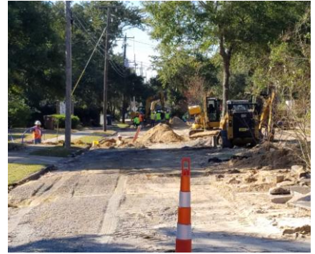
Father Ryan Avenue Infrastructure/FEMA repair project is progressing south of the railroad.