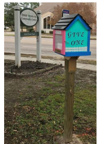
Little Free Library Snyder Center on Pass Rd