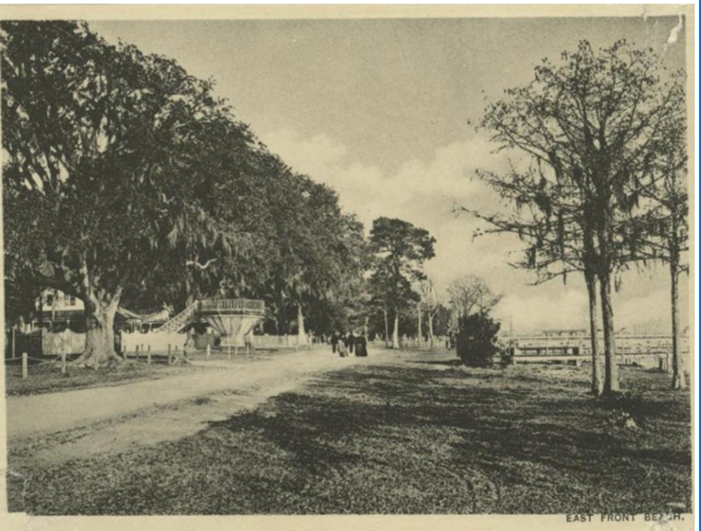
East front beach (Beach Boulevard), Biloxi, date unknown