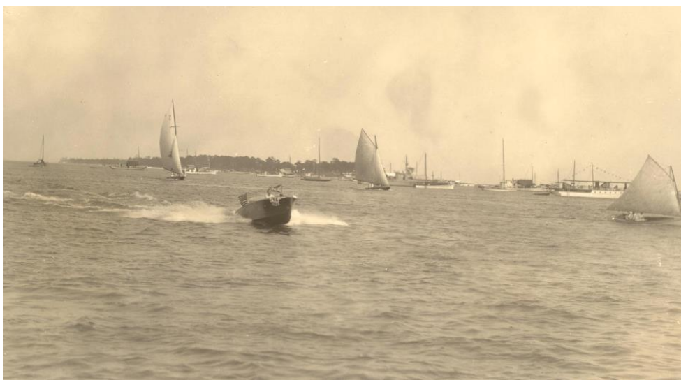
Boats along Biloxi's front beach, Deer Island in the background, 1920