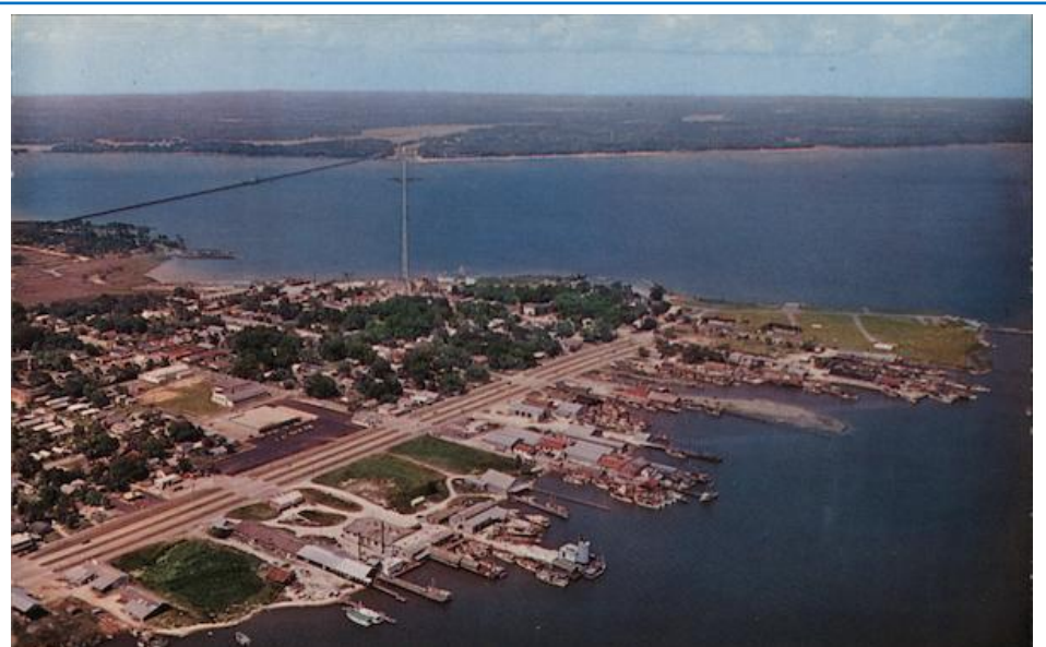
Aerial view of shrimp factories and boat docks, current sites of Golden Nugget casino, Harrah's casino, and Margaritaville... 1960s maybe.