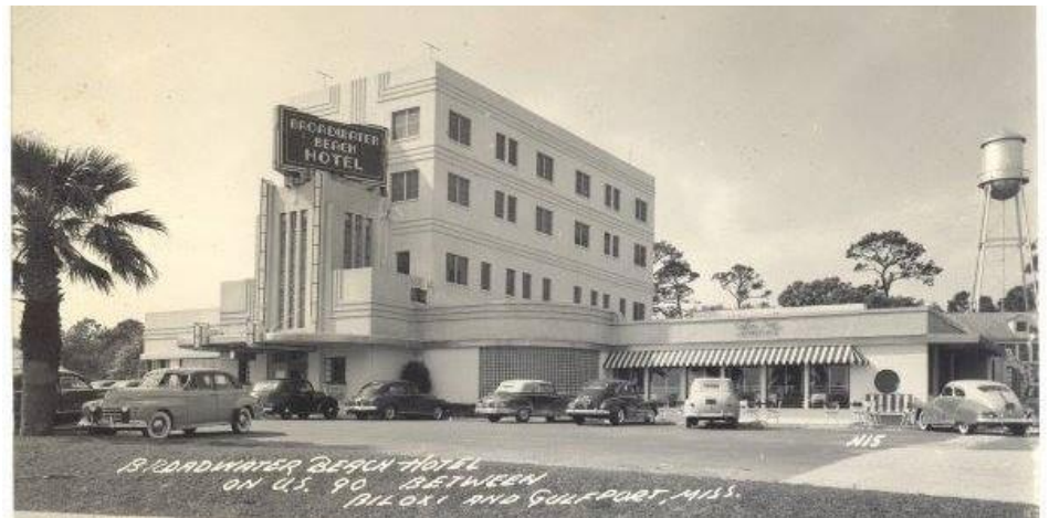
Broadwater Beach Hotel, north side of Hwy 90 directly across from the old Broadwater Marina, circa 1950