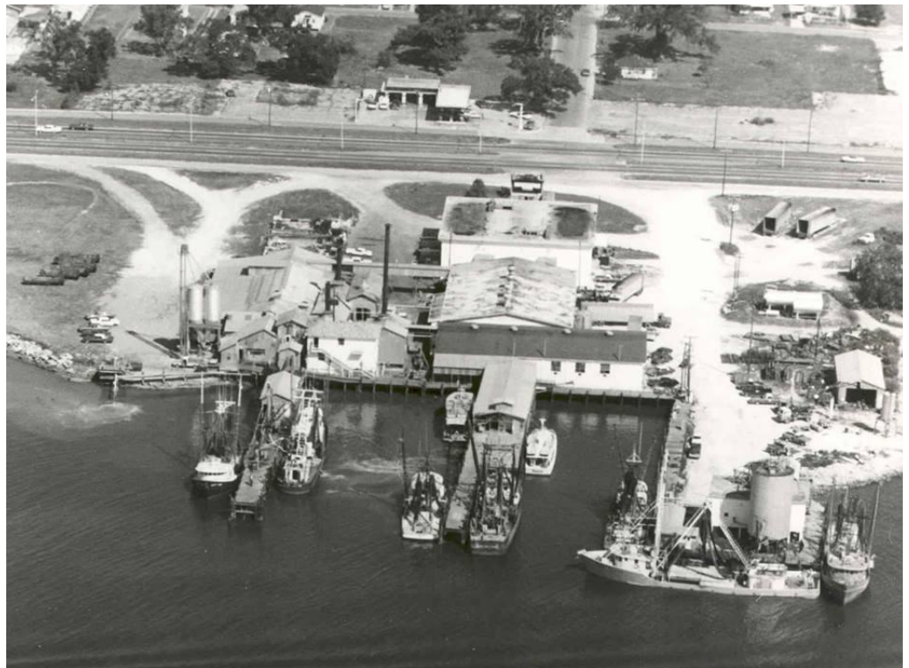
Mavar's seafood factory, Highway 90, east beach, circa 1960s (Roughly, current site of Harrah's Great Lawn and Margaritaville)